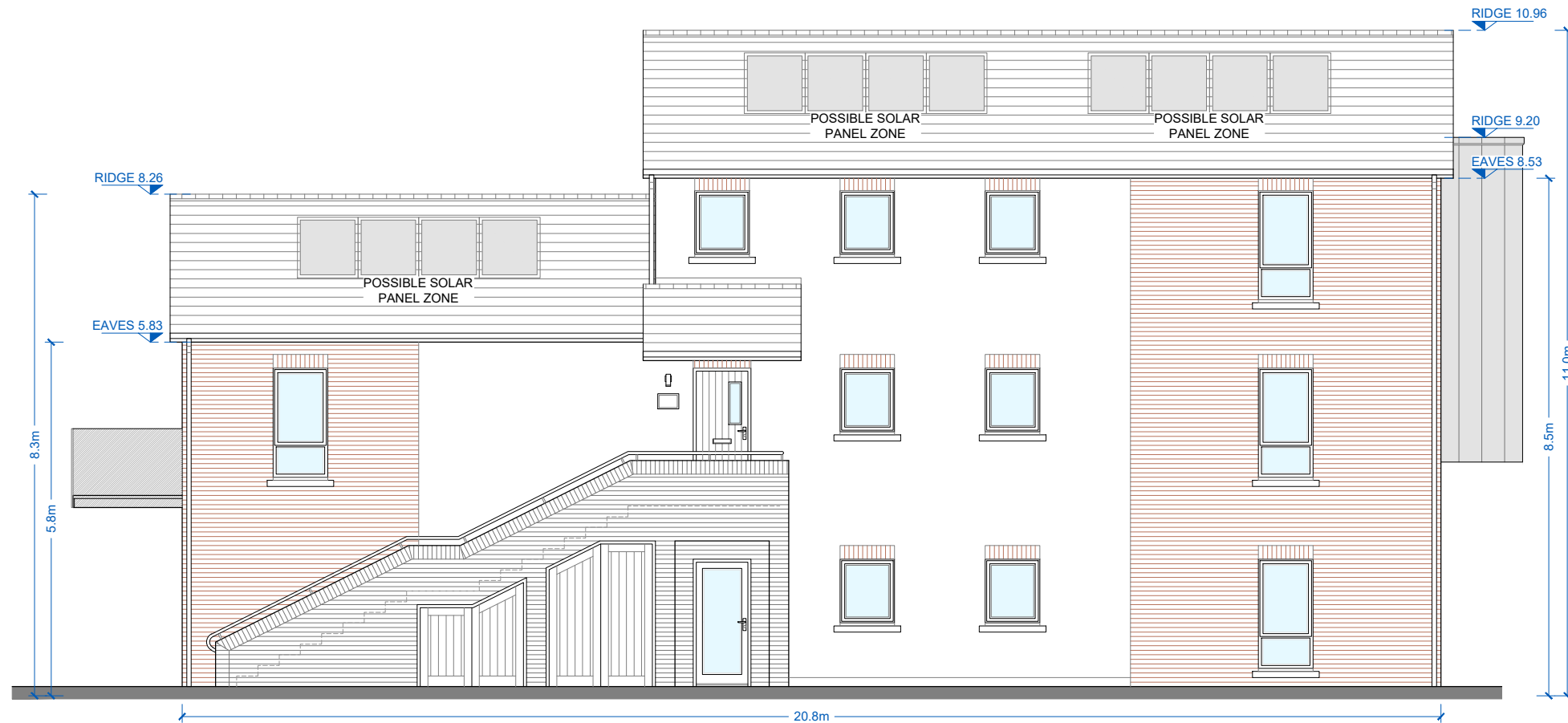
REAR (SOUTH EAST) ELEVATION SCALE 1:100

LEVELS, ORIENTATION AND SITUATION (E.G. DETACHED, SEMI-DETACHED OR TERRACED) VARY PER UNIT. REFER TO SITE PLAN FOR LEVELS, ORIENTATION AND SITE CONTEXT INFORMATION.